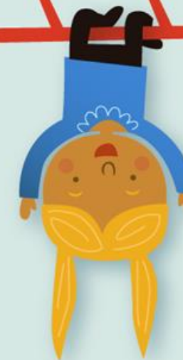
Year 6 Graduation